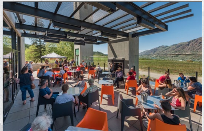
Terrace open daily 11:30 am - 6 pm (unless it is raining)