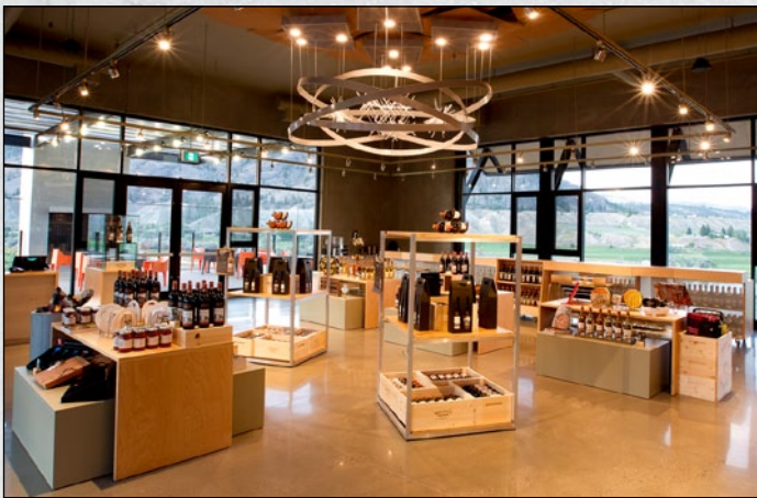
Tasting Room open daily 10 am - 6 pm

Both the Tasting Room and the Terrace offer spectacular views across the South Thompson River to the Lion's Head on the north side of the valley (worth the stop all on its own!).