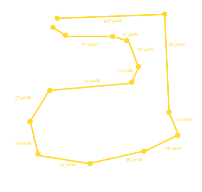
Sunday Course Plan – approx. 600 yards