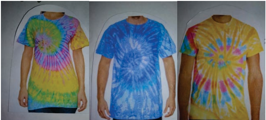
Shirt #1 multi colour pastel Rainbow

The Wolfstock Weekend logo will be on the front of the shirt