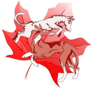
IBIZAN HOUND CLUB OF CANADA

For HOTEL/MOTEL ACCOMMODATION please refer to the following web sites: www.OfficialPetHotels.com http://www.travelpets.com www.doginmysuitcase.com