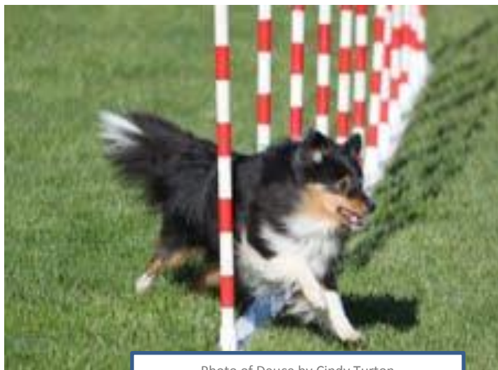
Photo of Deuce

Indoors on packed dirt at Kelowna Dog Sport Centre.