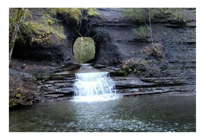
Roger Creek Nature Trail – Log Train Trail