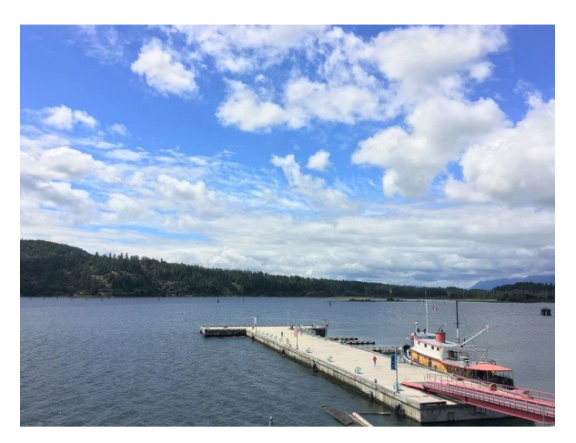
Waterfront Park - Canal Beach

Harbour Quay – Centennial Pier – Tyee Landing